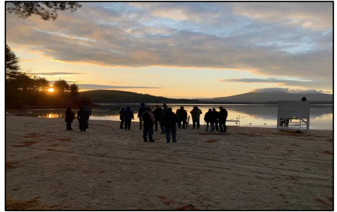
Easter sunrise service Slope n' Shore Beach